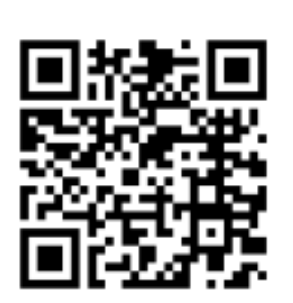
Scan this code to watch